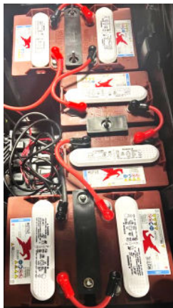
Figure 1. Beyond 4 Passenger with a total of 6 lead acid batteries. Batteries are located in the 2nd row storage, underneath the flip seat.

Our standard vehicles are equipped with lead-acid batteries. The quantity of batteries will vary depending on the cart model. See Figure 1 and Figure 2 below for distinction.