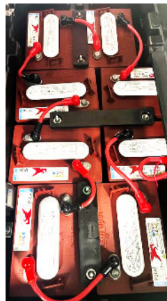
Figure 2. Beyond 6 Passenger with a total of 8 lead acid batteries. Batteries are located in the 1st row storage, underneath the flip seat.