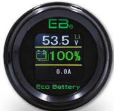
CAN LCD METER

For carts with a supported Eco charger, the state of charge meter is the EB LCD meter.